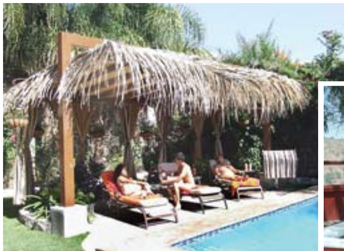
Guests enjoy the warm sunshine and pool at Amigos Casa in Mexico.

Since our best market for our tropical paintings is the Tampa to Naples area in Southwest Florida, finding Casa Alegre along that path was a dream come true. It had been a C-OHN home for just a few months when we first stayed there in the fall of 2013. Meeting all of the requirements of a C-OHN home—the full breakfast, private bed and bath wing of the house, walled outdoor area with pool and hot tub, refrigerator space, luxurious bed, and a sense of security—were all met to our delight. The unexpected bonus was the hosts. Casa Alegre's owners retired only a short time before they purchased this home and put in the pool and hot tub, could not have been more delightful, and we now consider them friends. We were tended to when needed and left