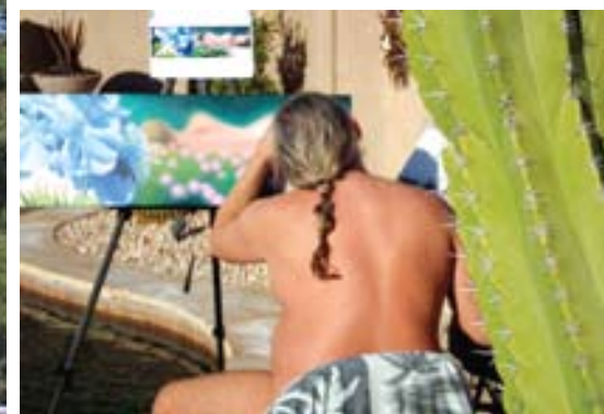
Lee repairs minor shipping damage on the commissioned painting of C-OHN's logo, poolside at Arizona Lagoon del Sol.